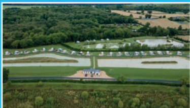
Stretton Lakes Touring Park Oakham, Rutland (Page 15)

We're very pleased to introduce two wonderful new member parks in this edition.