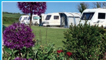
Parkland Caravan, Camping & Glamping Site Kingsbridge, South Devon (Page 29)

On the following pages you'll find an introduction to each park provided by the park teams. Always striving to provide the best experience they can, their upgrades and improvements continue. This year there are more luxury pitches and facilities, plus onsite convenience shops and charging points for electric cars.